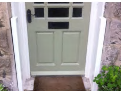
SIDE POST COVER PLATES