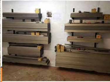
STORAGE RACKING UNITS